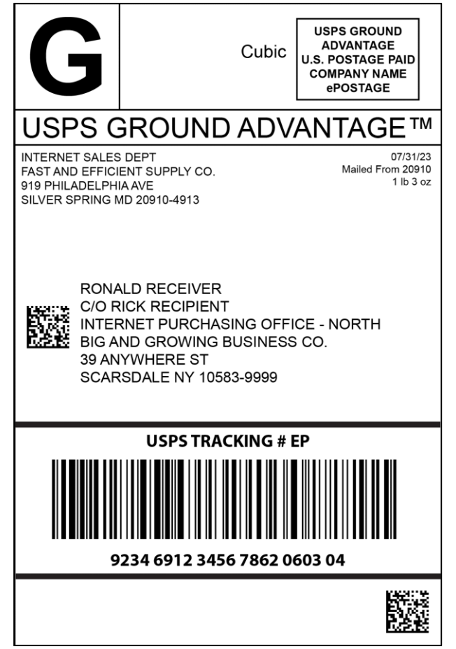
Figure 3: USPS Ground Advantage - ePostage Cubic Sample