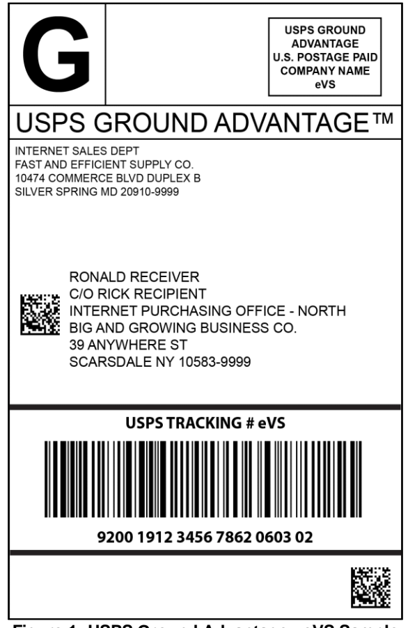
Figure 1: USPS Ground Advantage - eVS Sample