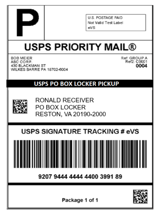
Figure 1: eVS Parcel Locker Label Sample