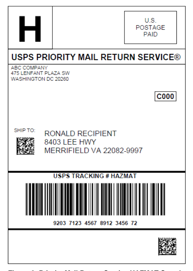
Figure 2: Priority Mail Return Service HAZMAT Sample