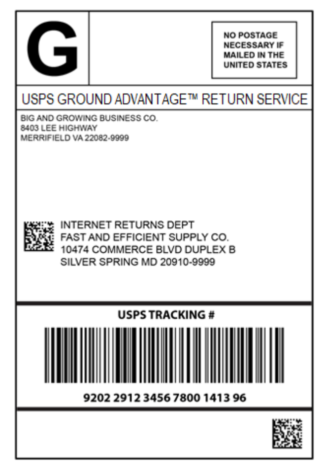
Figure 1: USPS Ground Advantage Returns Sample