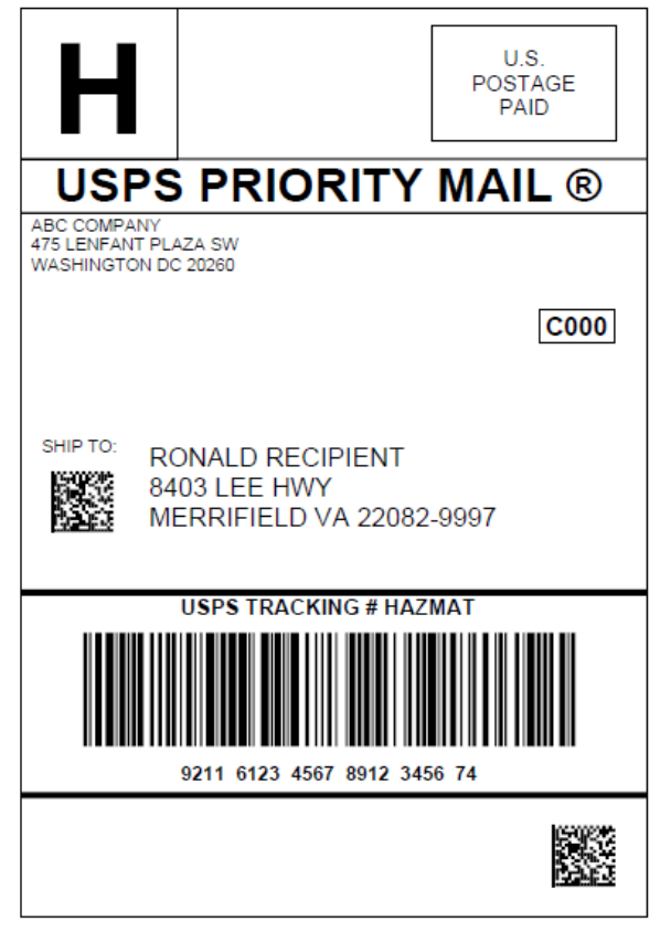
Figure 1: Priority Mail HAZMAT Sample Label