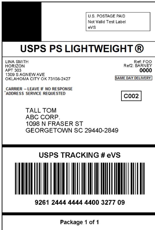
Figure 2: eVS PSLW Label

Reference June 2021 Release section 2.7.1