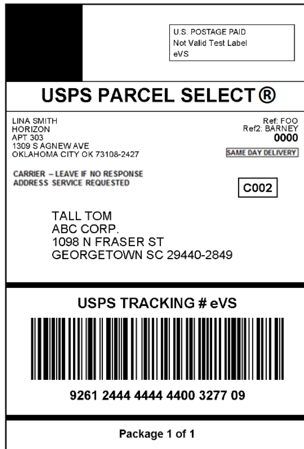
Figure 1: eVS PSDE Label

Reference June 2021 Release section 2.7.1